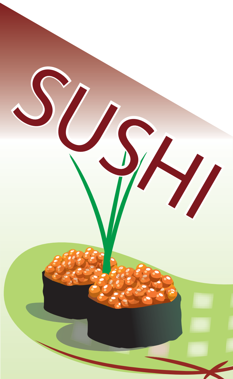
side 1 view