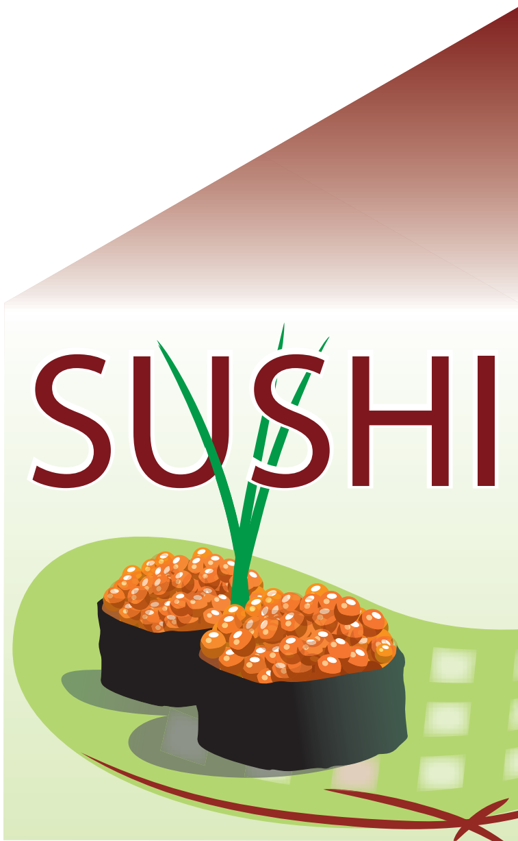
side 2 view

All artwork is created on one file. Any image or text must be identical in both the sides top sections unless you are happy for it to be deleted from one side.