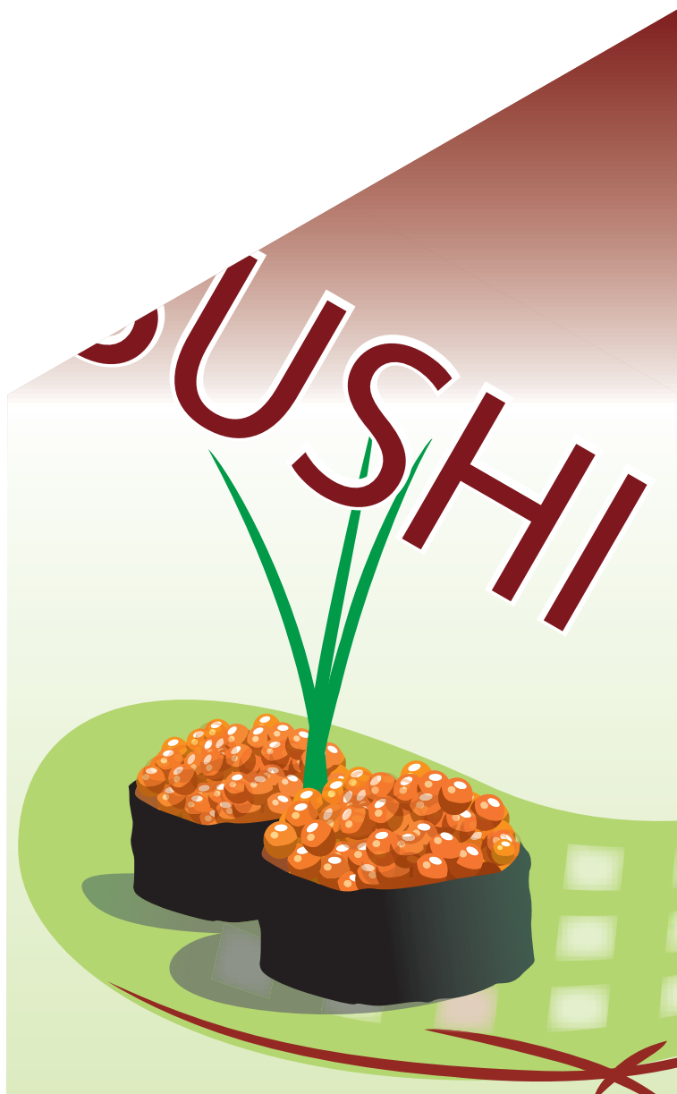
side 2 view